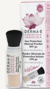
Derma•E Sun Protection Mineral Powder SPF 30 4g

Our blueberry probiotic contains delicious blueberry flavor! Our blueberry probiotic drink can provide good bacteria that already make up healthy gut flora, in turn supporting a healthy digestive tract for overall gut health and wellness. Good gut health can help support a balanced diet and a healthy lifestyle. Your gut and taste buds will thank you.