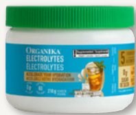
Organika Electrolytes Assorted Varieties 210g