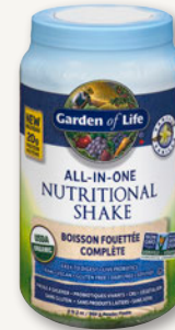
Garden Of Life Proteins Assorted Varieties & Sizes

Most vitamin E supplements contain only one form - D-Alpha-tocopherol - and often the synthetic form. There are eight compounds that make up the vitamin E family, all present in Vitamin E8, including four tocopherols and four tocotrienols. They are extracted from vegetable oils and are present in their natural, fully active, unesterified form. Likewise, food contains all eight compounds, to which our bodies are accustomed. Vitamin E8 also provides plant squalene and beta-sitosterols, all non-GMO certified.