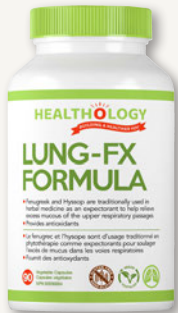
Healthology Lung-FX Formula 90 Capsules