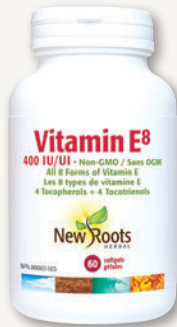
New Roots Vitamin E8 400IU 60 Softgels/120 Softgels