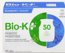
Bio-K Probiotics Assorted Varieties 12-Pack

Introducing Organika's newest electrolyte flavour - Iced Tea. In before summer, you can now hydrate all day every day and feel refreshed from the inside out. With no sugar, no caffeine, just pure thirst-quenching hydration. Our formula also contains prebiotic fibre that helps support the growth of beneficial flora, promoting overall gut health. Simply add to water for a tasty and hydrating drink with 0g of sugar.